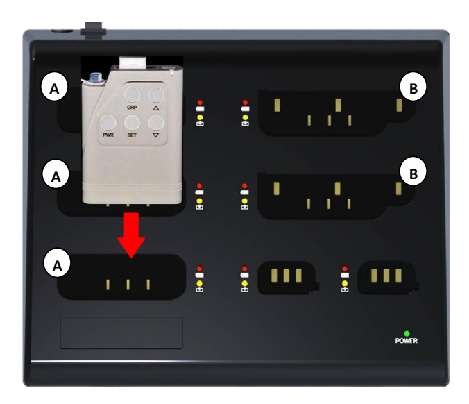
[Figure 5: Put the Belt Pack into the charging bay (A) and or (B)]