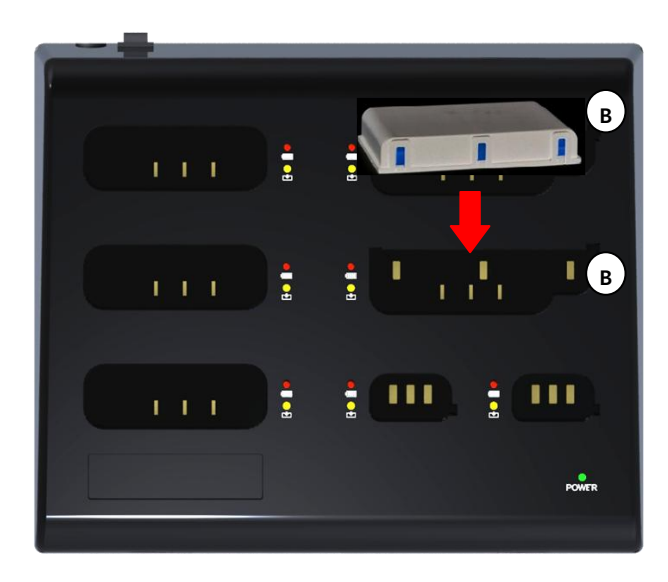
[Figure 7: Put the LTWI-BAT150 Rechargeable Battery Pack into the charging bay (B)]