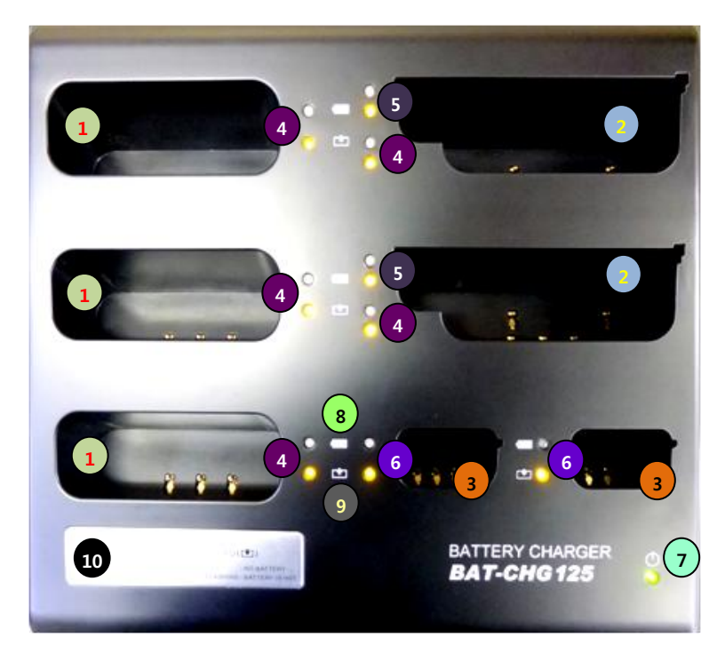
[Figure 1: LTWI-BATCHG125 Battery Charger]