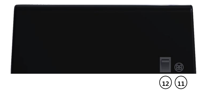
[Figure 4: Rear panel of the LTWI-BATCHG125 battery charger]