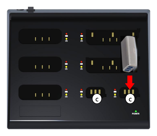
[Figure 6: Put the LTWI-BAT50 Rechargeable Battery Pack in the charging bay (C)]